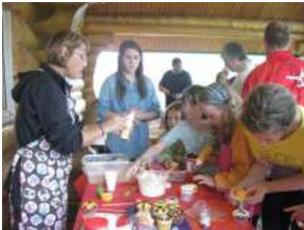
Cupcakes at Mapleton Lodge, Oct. 1